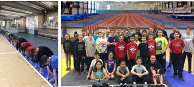
The 2018 track team hard at work!

And attention 6-8 th graders: what we always preach on this track team besides good grades and conduct is, "The best thing about Memories – is making them."